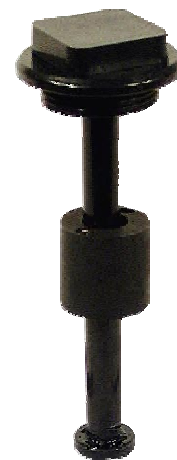
W2 Water Sender