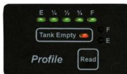
SOLO E - SOLO F