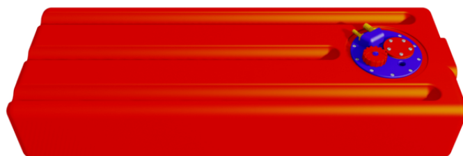
MODULAR RANGE FUEL TANK